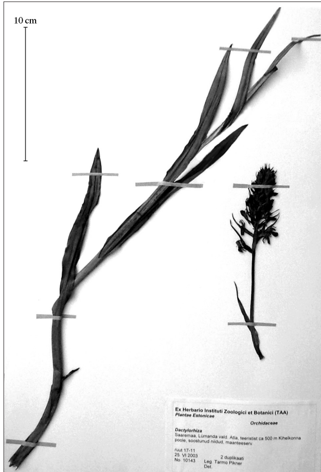
Fig. 3. Holotype of Dactylorhiza osiliensis

Etymology: osiliensis , is, e: from the island of Saaremaa (Estonia), named Osilia in Latin.