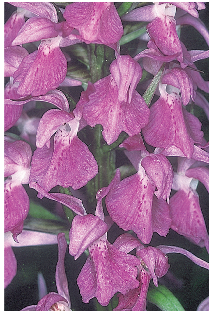
Plate 7. Dactylorhiza osiliensis (Estonia, Saaremaa, Lümända 27.VI.2005).

Top: The plants slenderness and the narrow leaves are obvious. Bottom: flowers deep-colored, labellum broader in the upper half; base narrowly withish; punctuation restricted to the labellum base; side lobes veined; spur straight.