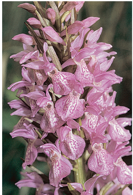
Plate 6. Dactylorhiza praetermissa . Top: The plants robustness and the rather broad leaves are obvious; left: quite dark-colored flowers (The Netherlands, Holland, dune slack, 9.VI.2001); right: rather rare somewhat reddish-colored flowers (Belgium, Hainaut, sandy soil formed in recently dredged material, 29.VI.1991). Bottom: flowers pale-colored, labellum broader around the middle; center broadly withish, strongly marked. left: The Netherlands, Holland, 9.VI.2001; right: France, Aisne, 18.VI.1980.