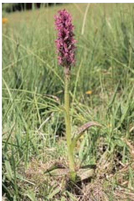
Plate 1. Dactylorhiza incarnata and D. cruenta (from Italy).

Above left: Dactylorhiza incarnata var. hyphaematodes , Saaremaa, Koruse. 28.VI.2005; right: D. incarnata var. sublatifolia , Saaremaa, Undva. 28.VI.2005. Below left: D. incarnata cf. var. borealis , Läänemaa. Laelatu. 22.VI.2005; right: Dactylorhiza cruenta . Italy, Belluno, 6.VII.1989.