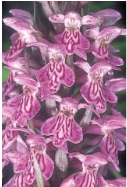
Plate 2. Orchids of Estonia. Dactylorhiza baltica

Above left: Pärnumaa. Treimani. 23.VI.2005; right: Pärnumaa. Pärnu. 20.VI.2005.