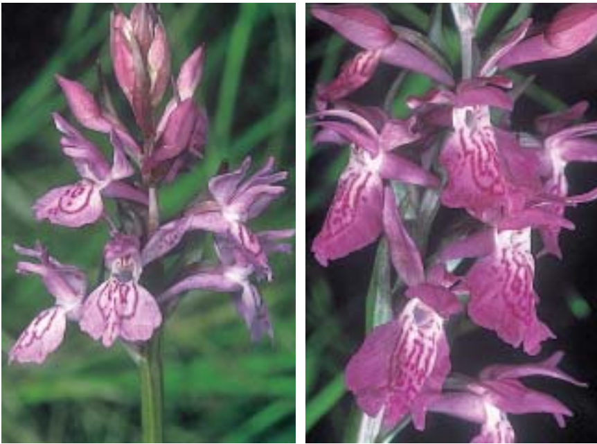
Plate 3. Orchids of Estonia. Dactylorhiza curvifolia

Above left, center: Saaremaa, Viidu. 26.VI.2005; right: Läänemaa. Alemaa, 24.VI.2005. Below left: Saaremaa, Viidu. 26.VI.2005; right: Saaremaa, Viidamäe national park. 28.VI.2005.