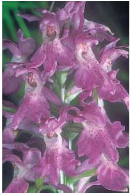
Plate 4. Orchids of Estonia. Dactyloriza ruthei

Läänemaa. Puutu nature reserve. 21.VI.2005.