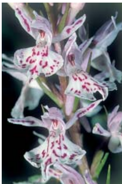
Plate 5. Orchids of Estonia.

Above. Dactylorhiza incarnata × D. fuchsii ( D. praetermissa auct. Eston. non (DRUCE) SOÓ). Hiiumaa. Kõrgessaare. 25.VI.2005.